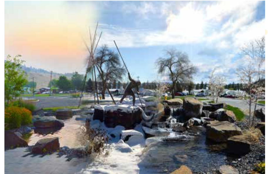
Vaughn, Nanette. Gov. Building 2021 Vaughn, Nanette. Bitter Toot 2023