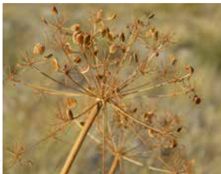
2023 ©Colville Confederated Tribes ~ Employment & Education.