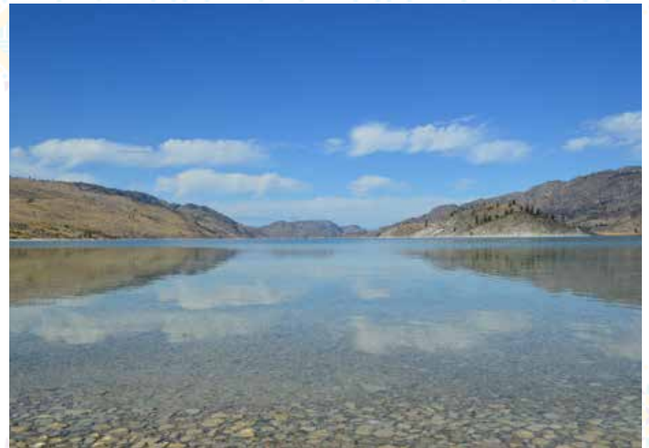
Vaughn, Nanette. Omak Lake 2022