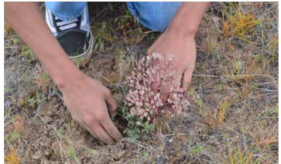
Vaughn, Nanette. Root Digging 2023