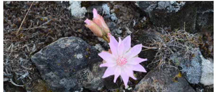
2023 ©Colville Confederated Tribes ~ Employment & Education.