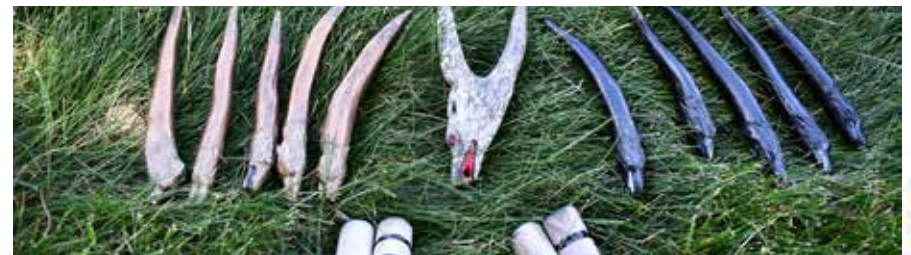
Images on left: Vaughn, Nanette. Chocolate root 2023 Image above: Vaughn, Nanette. Stick game Set 2023