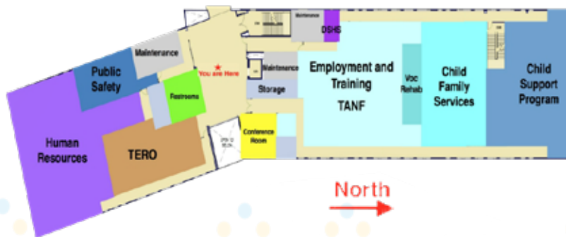
2nd Floor East