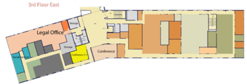
3rd Floor East