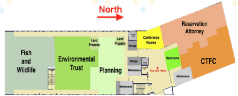
2nd Floor West