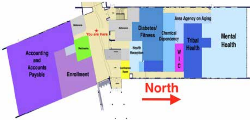
1st Floor East