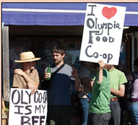
Olympia BDS activists.

CCR and co-counsel won a motion to strike a lawsuit against Board Members of the Olympia Food Co-op after the Board passed a resolution to boycott Israeli products. The court found that the Board members had acted within their duties on an issue of public concern, and that the lawsuit was designed to hamper their free speech rights to engage in a boycott movement of national proportions. The individuals who brought the lawsuit, supported by StandWithUs, were directed to pay attorney fees and penalties for bringing the suit. They have appealed.